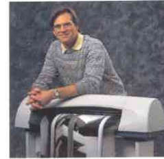
An optional stand

ENCAD Cromaz4 is an advanced, sophisticated machine, yet it's extremely easy to operate. Offering full PC connectivity, and compatibility with today's most popular CAD software packages, ENCAD Cromaz4 features a straightforward software interface, making it as easy to use as a typical desktop printer. Knowing that you're always working against a tight timeline, ENCAD Cromaz4 is a very efficient worker. It features snap-in cartridges for quick and easy replacement. And cartridge life can be extended with ENCAD QIS refill kits, for maximum economy. Also included is a built-in roll media feeder and an automatic cutter, two features which are costly add-ons or even unavailable with many competitive wide-format color printers. And, since good looks never hurt in any line of business, the ergonomically-designed ENCAD Cromaz4 has a stylish, contemporary feel that's sure to fit right into any office or studio environment.