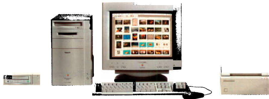
Computer not included.