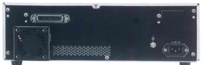
UP-D2600 Rear Panel