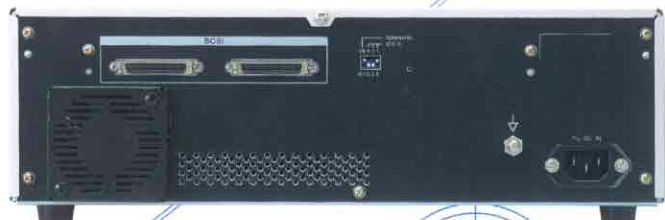
UP-D2600S Rear Panel