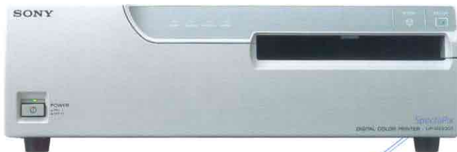
UP-D2600S Front Panel