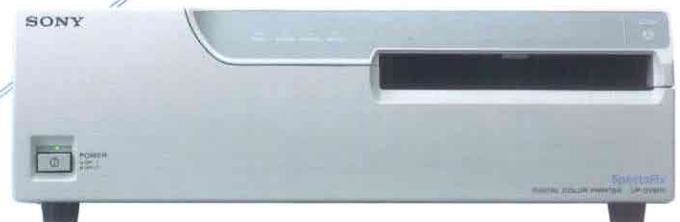
UP-D2600 Front Panel