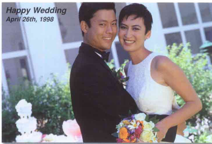
Happy Wedding April 26th, 1998