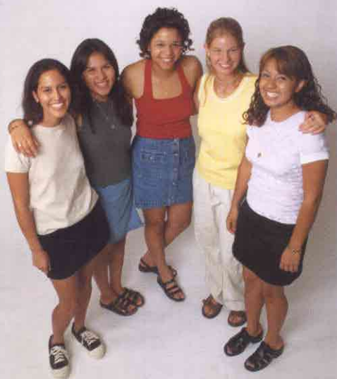
Washington High School